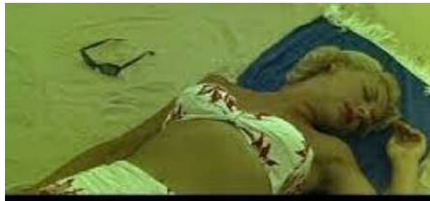
Queensland Playground - 1957