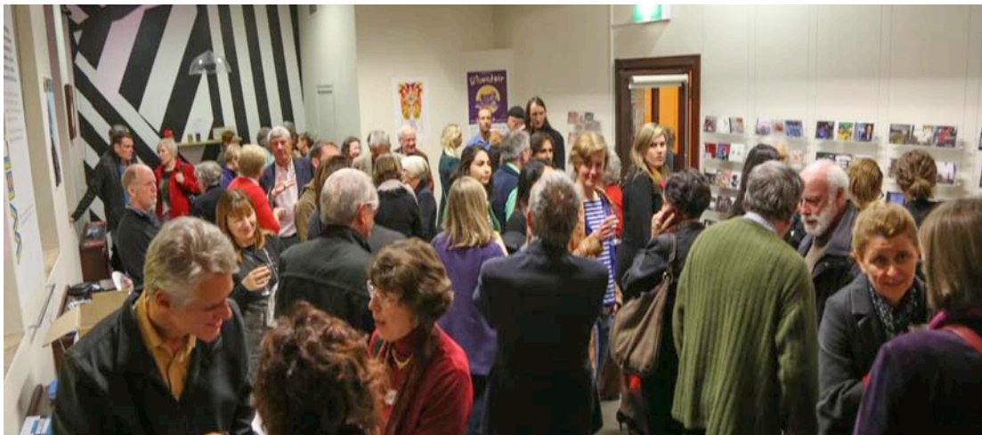
The crowd mingles happily prior to our last 'Friday With Friends' event