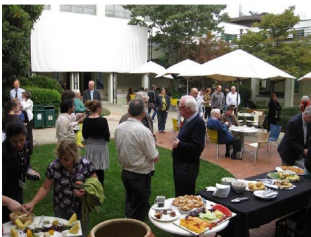
Members of the Friends of the NFSA enjoying the party atmosphere and the lovely courtyard in our building.